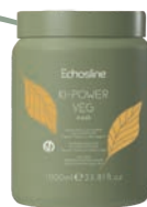
Ki-Power Veg Mask