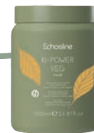
Ki-Power Veg Mask