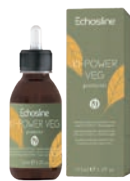
Ki-Power Veg Protector