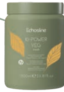
Ki-Power Veg Mask