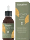
Ki-Power Veg Protector