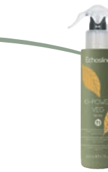
Ki-Power Veg Spray