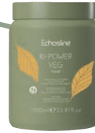
Ki-Power Veg Mask