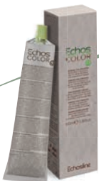
Echos Color Hair Colouring Cream