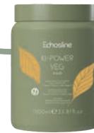
Ki-Power Veg Mask